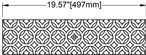
Decorative Pattern: Imperial Star